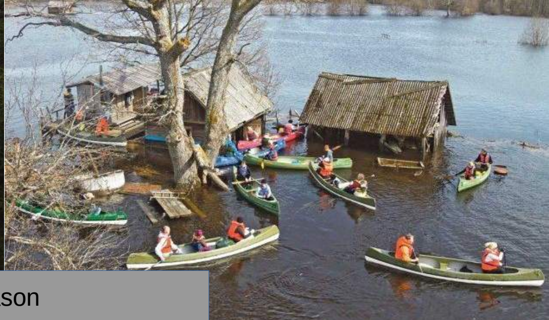
Flood season as an attractive tourist season