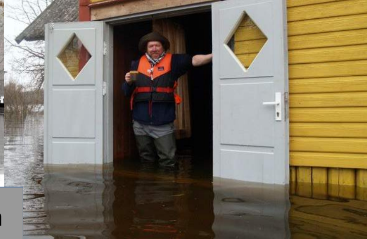
Local people have adopted their lifestyle to fifth season